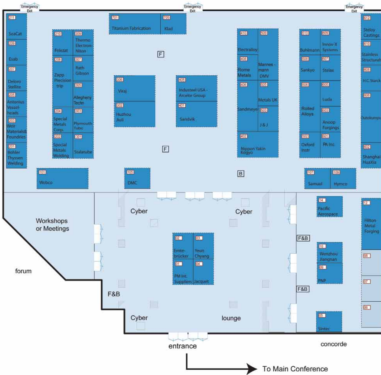
List of Exhibitors Stainless Steel World Solutions USA 2006